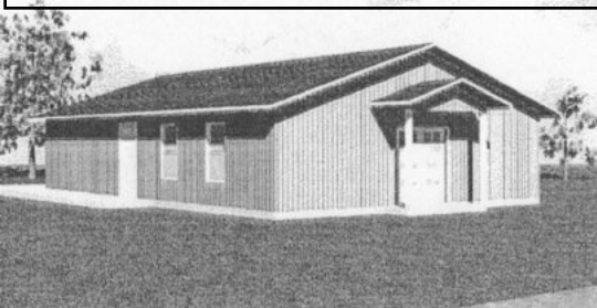
Construction is underway on the new restrooms and meeting room at the marina with completion in time for 2011 spring & summer activities .