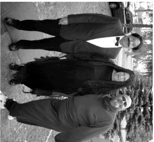
Read about Halloween Fun inside!!!