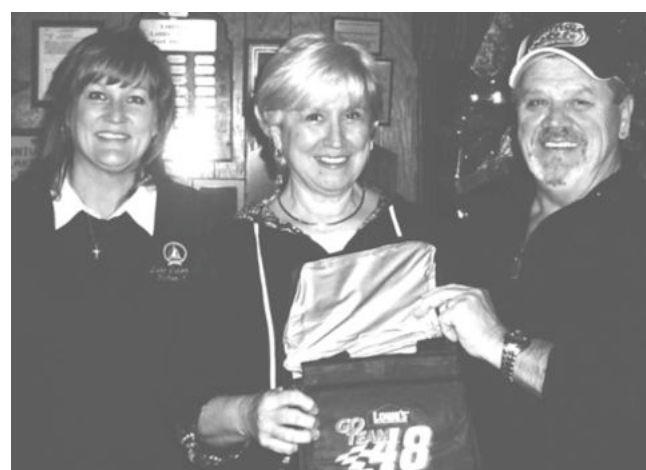
Various winners: Top to bottom: