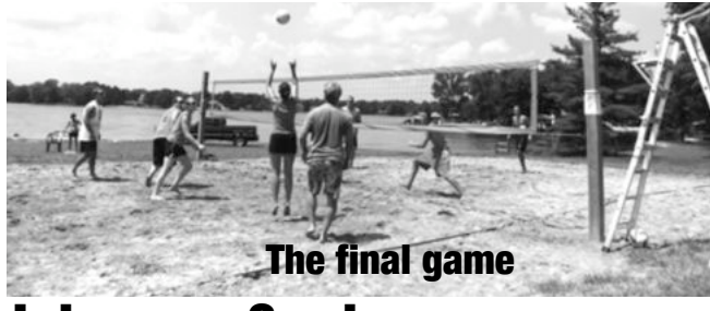
The final game

Thanks for the memories of days gone by. Days brightly colored by a child's imaginative eye. Quiet country sunsets and lazy summer days. Green, rolling pastures, where cows contentedly grazed. The son of birds and the music of a bubbling stream. The tall, warm grasses where I sat and dreamed. September brought the school bus, as it had done before. But when it came for me, first time, the meaning held something more. A world of textures, color and smell, The thrill of learning, and playing, as well. Teeter-totters, slides and the merry-go-round. Singing Row, Row, Row Your Boat in rounds. Thanks for those other children, with whom I played, learned and shared, The playground, the classroom, and teachers who cared. My body and mind grew with the years. As did my friendship with these people - my peers. My school, my teachers, my friends, I most fondly remember. And, could you guess, my favorite month has always been September? Those days, I hope, will always remain, a twinkle in my eye. And once again, could I just say, thanks for the memories of days gone by.